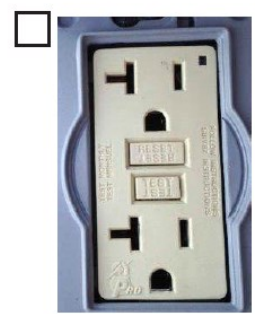
120 Volt, 20 Amps, GFI