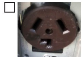
110 Volt, 30 Amps