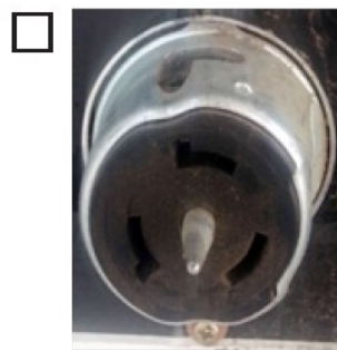
120/240 Volt, 50 Amps, Twist Lock – 3 Wire