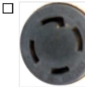
240 Volt, 50 Amps Twist Lock – 4 Wire