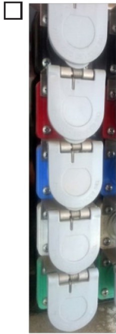
100 Amps, Cam or Cannon plug

Please check which type of outlet you will need as well as the quantity.